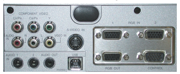
The ImagePro 8801A inputs are easily accessible.

quieter operation with whisper mode setting, plus a 400-1 contrast, and a Kensington slot for secure installation. A custom start-up screen and digital horizontal & vertical keystone correction complete the features.